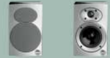
POINT5 MK II S.5 Satellites